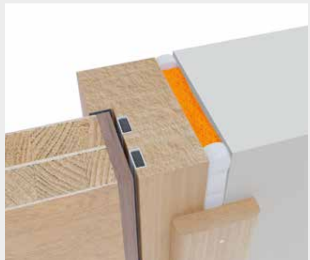
Image B – FAS Fire Door Intumescent Acrylic Sealant with Fire Door Foam™ for joint widths up to 25mm to achieve ratings of up to 120 minutes when applied correctly.