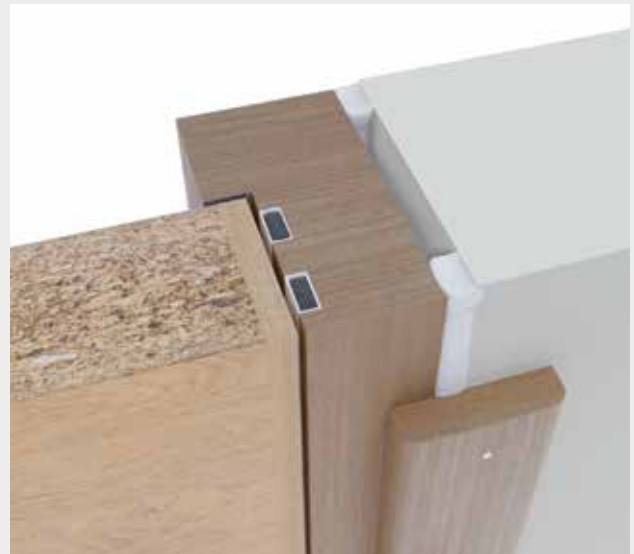
Image A – FAS Fire Door Intumescent sealant for joint widths up to 5mm require no backing.