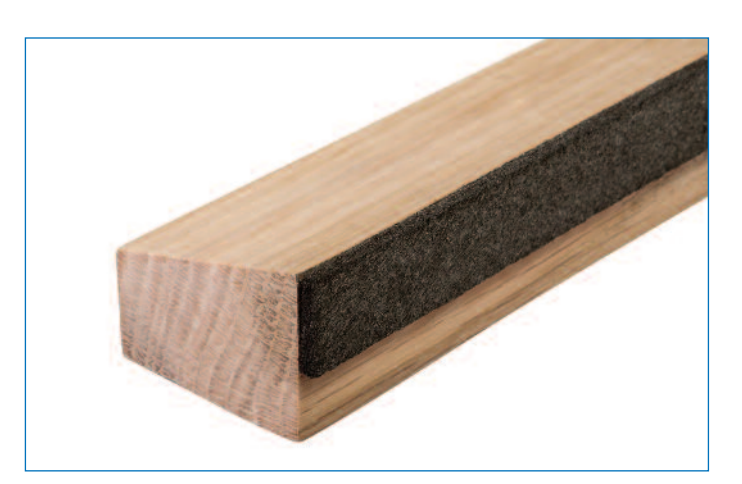
Available in 10m rolls ex stock