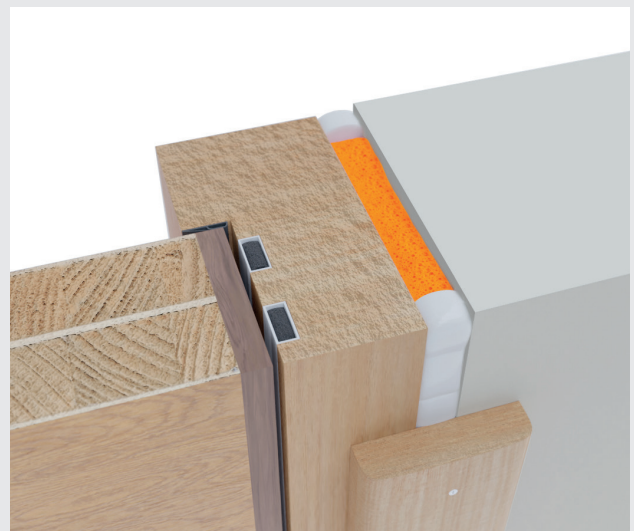
Image B – FAS Fire Door Intumescent Acrylic Sealant with Fire Door Foam™ for joint widths up to 25mm to achieve ratings of up to 120 minutes when applied correctly.