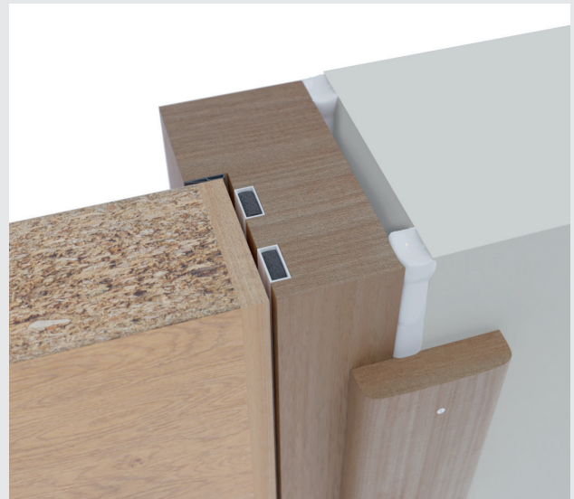
Image A – FAS Fire Door Intumescent sealant for joint widths up to 5mm require no backing.