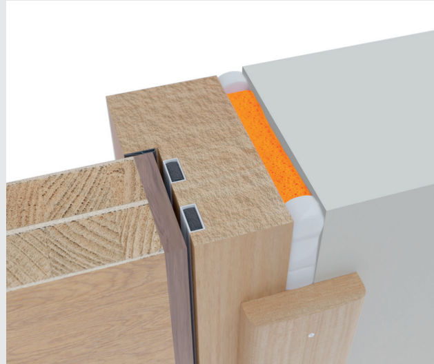
FAS Fire Door Silicone Sealant with FAS Fire Door Foam™ for joint widths up to 30mm to achieve fire ratings of up to 60 minutes when applied correctly.